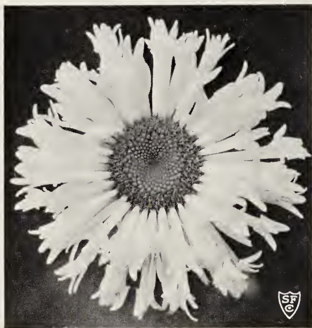
SHASTA DAISY MARIAN COLLIER

INULA ROYLEANA —Unique, new perennial for the hardy border or rockery. Handsome bright green foliage, with flower stems rising twelve to eighteen inches high, terminated with large, button-like, almost black flower buds, opening towards midsummer into deep golden yellow blossoms, resembling fairy-like sun-flowers in their exquisite petalage. This newcomer from the Himalayas is winning the admiration of all flower fanciers. Strong plants, 35c each; three for $1.00.